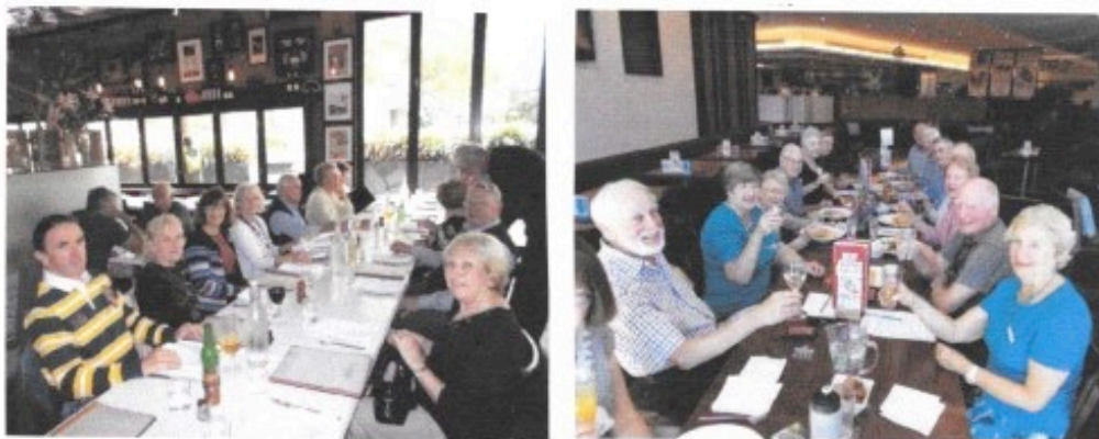
Happy diners at two of our regular Luncheon Club outings.