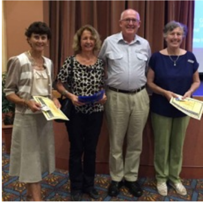
SEAFORTH PROBUS – 2015-16