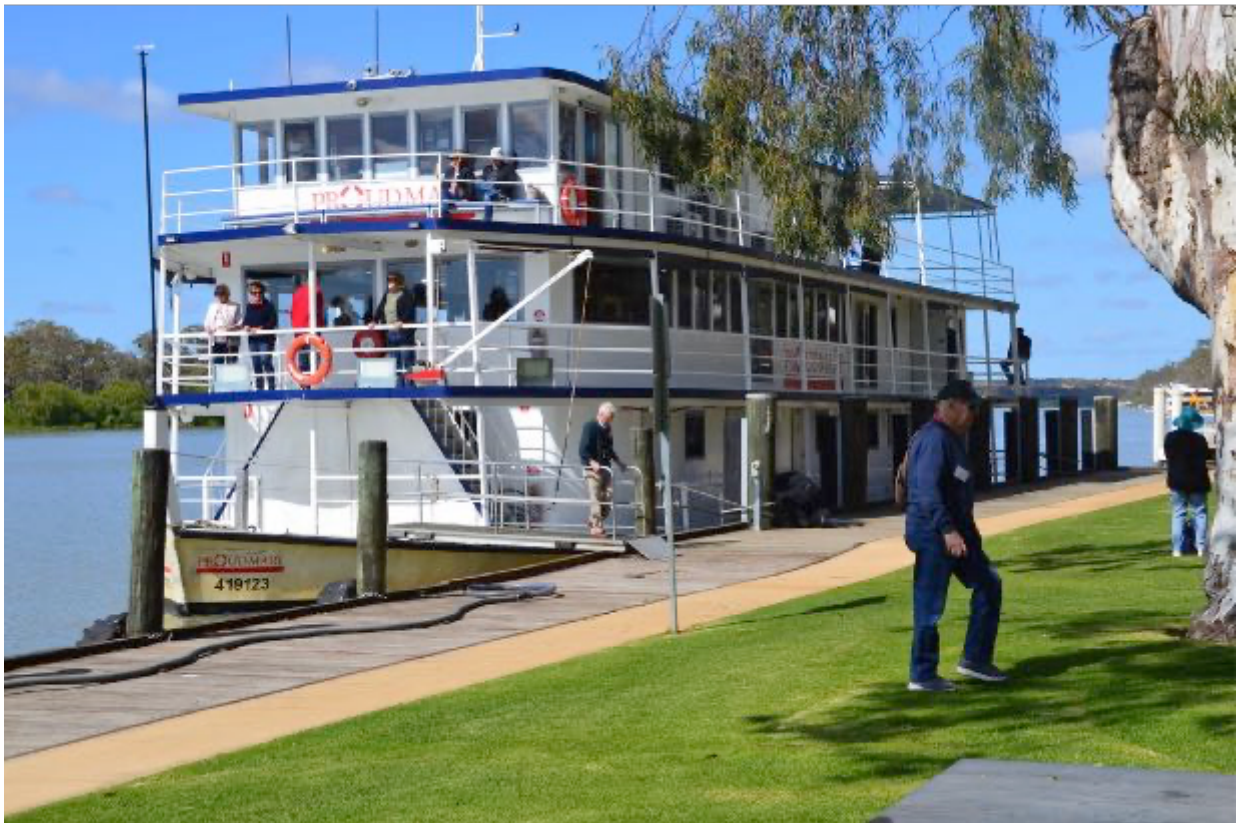
Probus Club of Seaforth Newsletter, November 2019