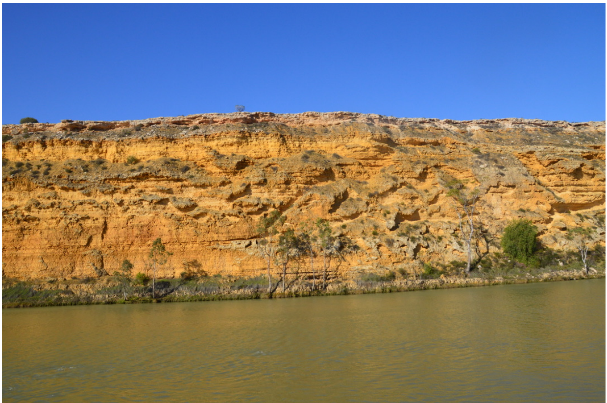
Probus Club of Seaforth Newsletter, October 2019